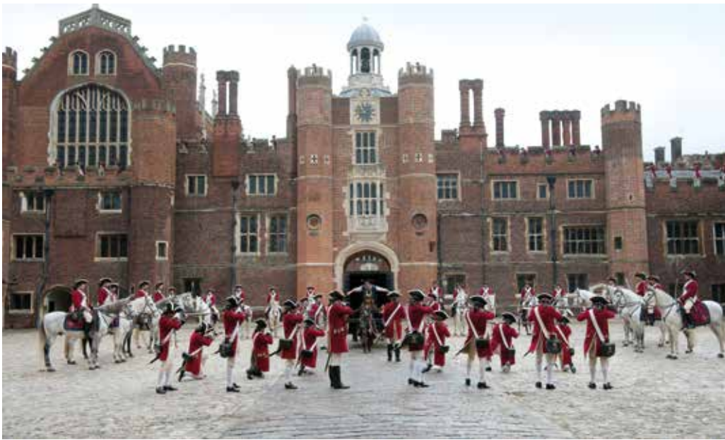
'Pirates of the Caribbean: On Stranger Tides' at Hampton Court Palace