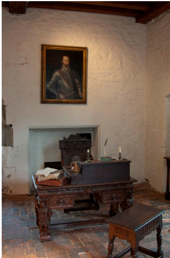
Sir Walter Raleigh's room at the Tower

There are no cells or dungeons at the Tower! Important prisoners were kept at the Tower because it was safe and secure.