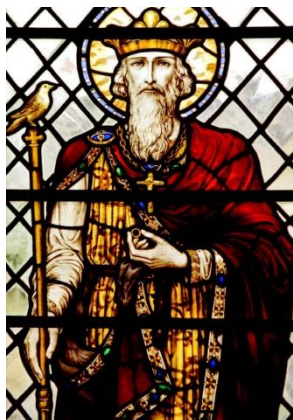
Edward the Confessor (c. 1003-1066) Reigned 1042-1066

Edward was the penultimate Anglo-Saxon king of England.