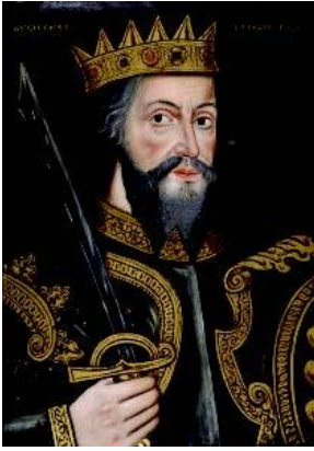
Duke William I of Normandy (William I of England)