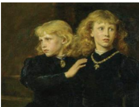
Princes in the Tower (Edward 1470 – 1483, Richard 1473 - 1483)

After six months of imprisonment, Flambard began to hatch a plan for his escape. He proposed to throw an elaborate banquet for his guards and requested that several barrels of wine be provided for the occasion. Within one of these barrels was a length of rope. The wine was plentiful and very soon the guards became intoxicated, enabling Flambard to make his escape out of the window, down the rope and onto a waiting boat. From here he travelled to Normandy.