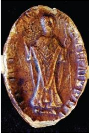
Ranulf Flambard (c.1060 – 1128)

Ranulf Flambard was probably the first state prisoner confined to the Tower, and also the first to escape from it!