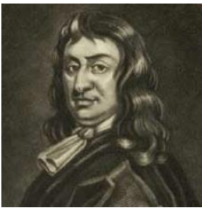
Colonel Blood (1618 - 1680)

Guy was escorted to Whitehall to confront James I in person and then to the Tower where he was subjected to various tortures before confessing and being sentenced to a traitor's death.