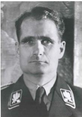
Rudolf Hess (1894 - 1987)

In 1699, Isaac Newton was promoted to Master of the Mint, a post he held until his death in 1727.