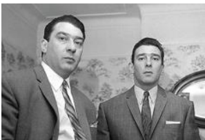
Ronnie and Reggie Kray (Ronnie 1933 – 1995, Reggie 1933 – 2000)

At a court martial Jakobs was found guilty of espionage and lodged overnight in the east turret room of the Waterloo Block before being executed by a firing squad. The chair used for his execution can be found in the Royal Armouries' collection.