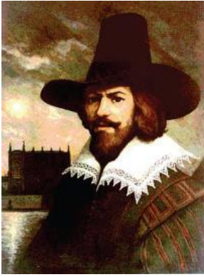
Guy Fawkes (1570 - 1606)

Guy Fawkes was described by his contemporaries as 'a man highly skilled in matters of war'. He was also a master of deceit, a characteristic which landed him a key role in the conspiracy known today as the Gunpowder Plot.