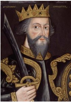
William the Conqueror (c.1028 – c.1087)

William Duke of Normandy became the first Norman king of England when he defeated Harold Godwinson's army at the Battle of Hastings in 1066.