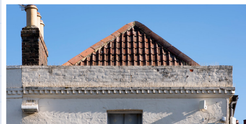
Roof that looks flat