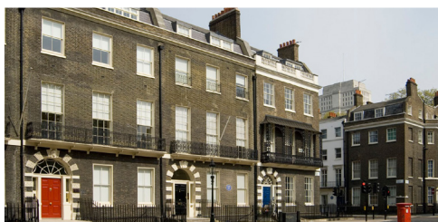
Long line of terrace houses