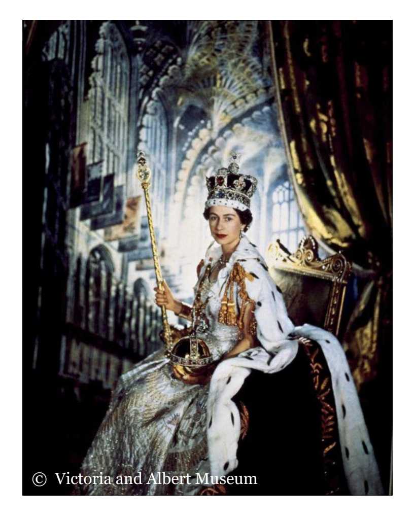
How many similarities can you see?