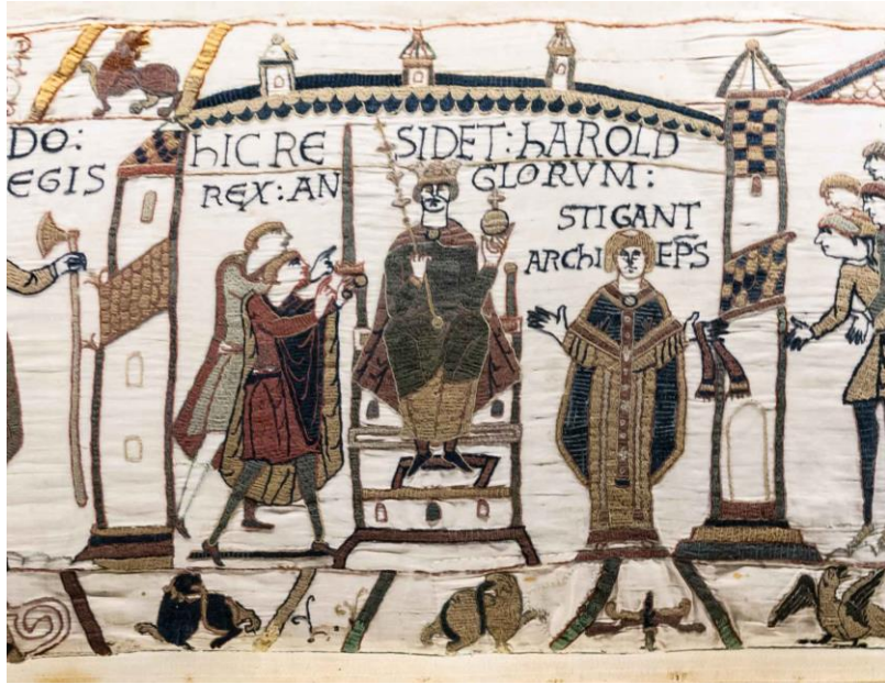
King Harold, Bayeux Tapestry 6 th January 1066