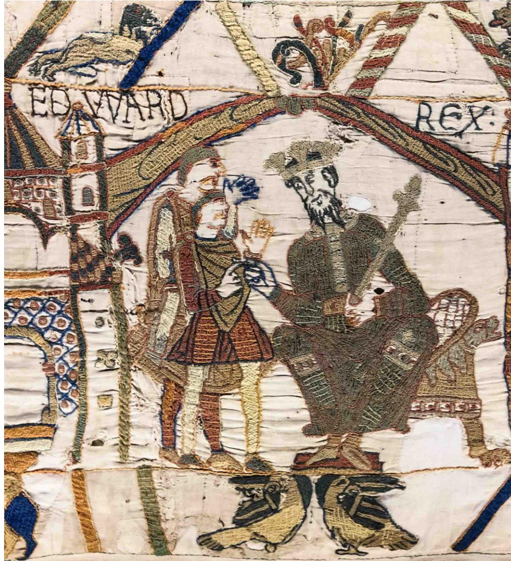
Coronation of Edward the Confessor, Bayeux Tapestry