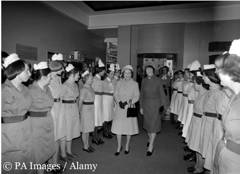
Queen Elizabeth II at Great Ormond Street Hospital, London, 1977