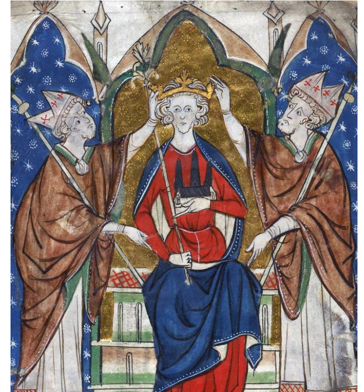
Henry III 28 th October 1216