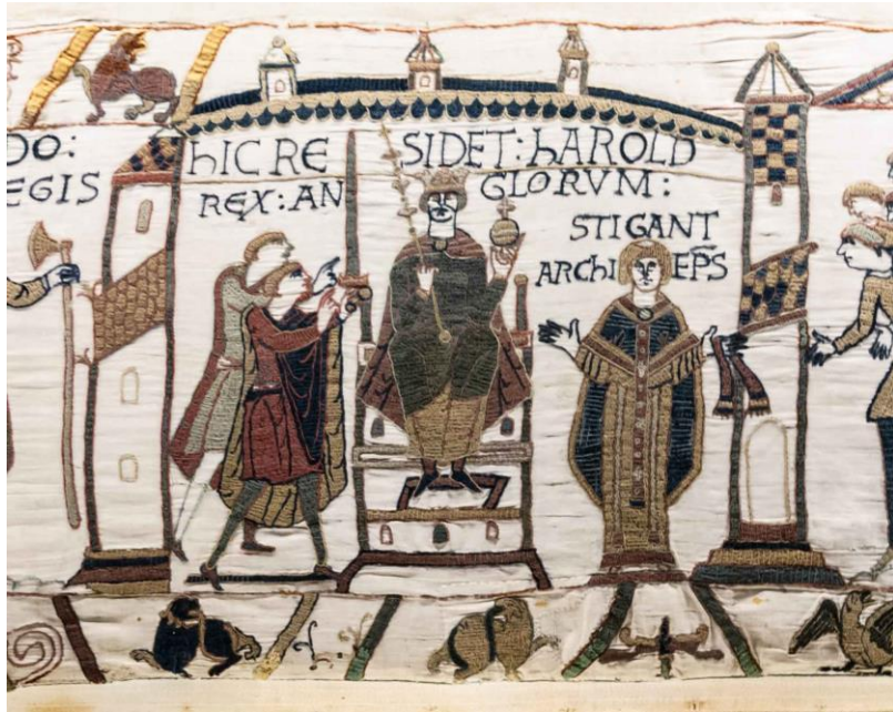
King Harold, Bayeux Tapestry 6 th January 1066