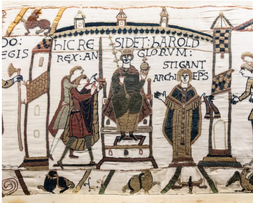
King Harold, Bayeux Tapestry 6 th January 1066