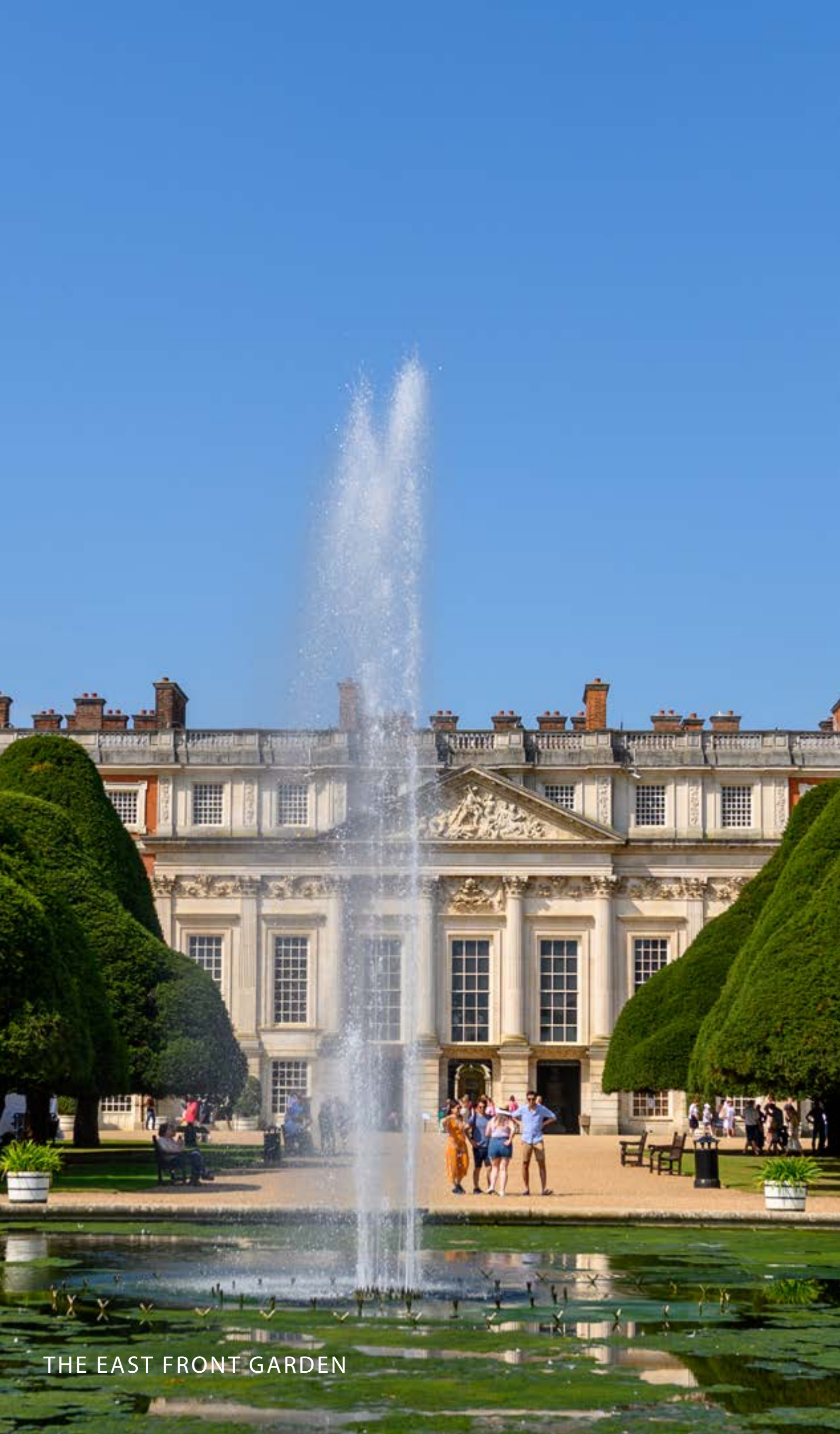
THE EAST FRONT GARDEN