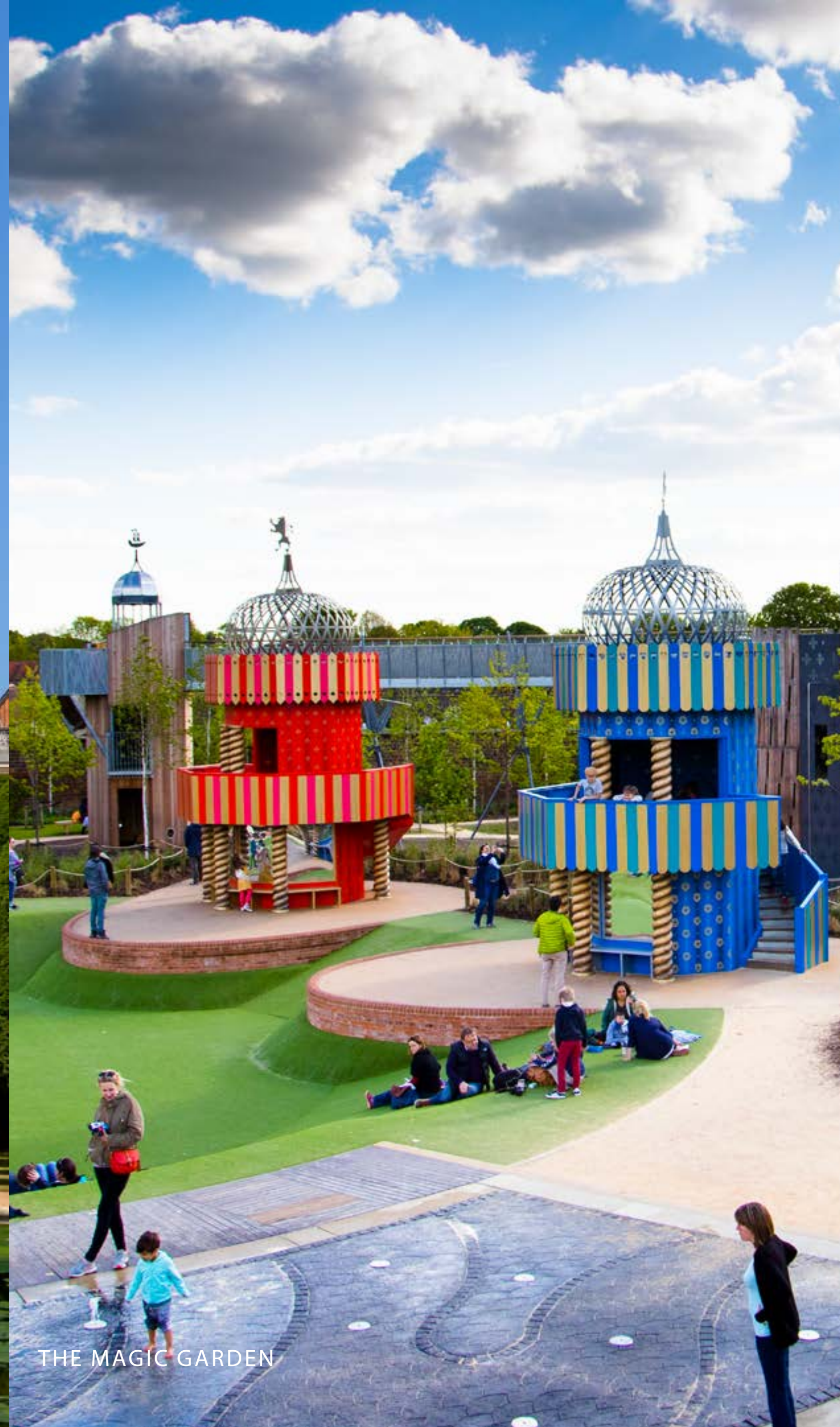
THE MAGIC GARDEN