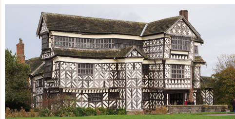
Wonky or uneven buildings

If you see these features, they might be clues that you've found a Tudor building .