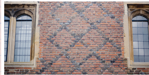
Zig-zag brick work