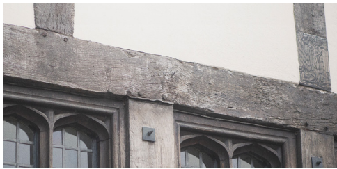
Timber (wooden) frames