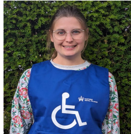
Image description: Left, Two armoured knights on horseback charge towards each other with their lances raised while a crowd of people watch. Right, smiling woman in blue accessibility tabard.