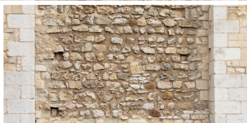
Large light-coloured stone